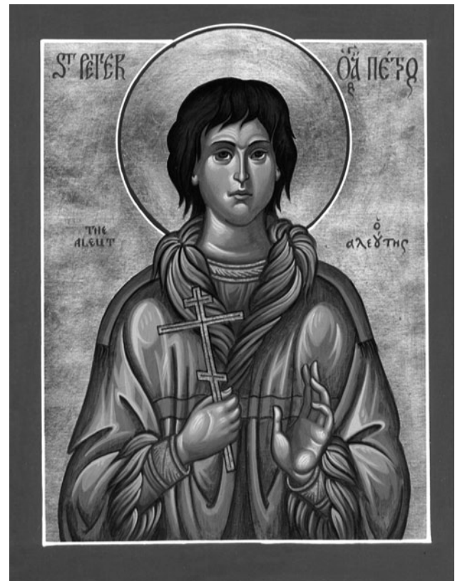
Figure 3. St. Peter the Aleut. Inscription is in English and Greek, as the icon was intended as a gift to the Kykkos Monastery in Cyprus.

It is ironic that through these acts of violence, which began with otter hunting trips to San Nicolas Island, two Native Americans—one a native of San Nicolas Island and the other a native of Kodiak Island—have become icons in contemporary culture, figuratively and literally.